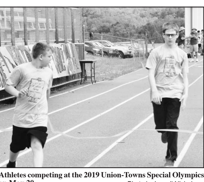
Athletes competing at the 2019 Union-Towns Special Olympics on May 20.

to complete the activities. "We enjoy this, because it's the time of the year that we